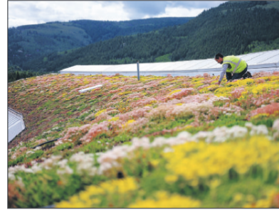
Traer Creek Plaza's eco-roof, which was revamped this summer, is covered with a living material called sedum, a hardy succulent native to the mountains.

Another highlight is "green" carpeting, which is offered free to office tenants and is made from biodegradable corn products, as opposed to regular carpeting, which emits harmful gases during the degradation process due to its petroleum-based components. Onsite showers allow employees